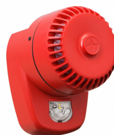
RoLP LX Wall Red